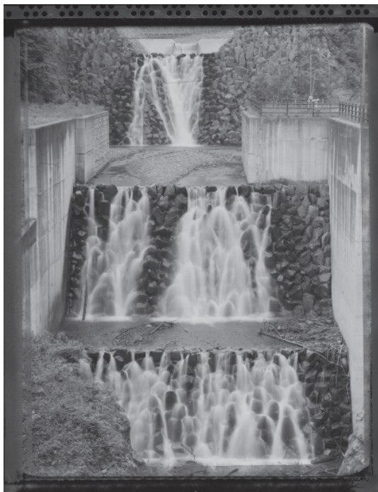
Chichibu City, Saitama Prefecture, 2003.