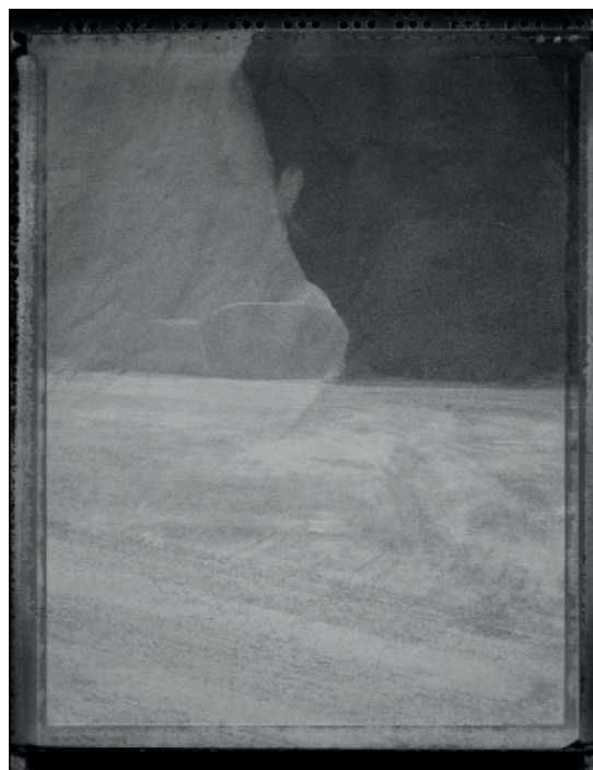
Oshika Village, Nagano Prefecture, 2000.