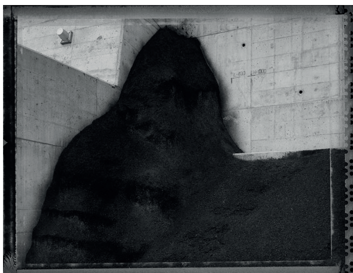
Makioka Town, Yamanashi Prefecture, 2003.