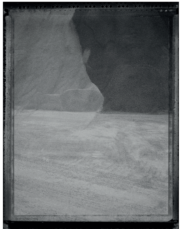
Oshika Village, Nagano Prefecture, 2000.

Between 2000 and 2004, Toshio Shibata began a period of experimentation during which he rediscovered the Type 55 film he had used as a student, and more than 400 shots were taken in Japan and the United States with this film. The chemical process of the film produced by Polaroid caused a break: during development, a border made up of raw, almost metallic lines and chemical traces appeared. Shibata decided to keep it. «When I look at the resulting image,» he explains, «I find myself on the borderline between a photograph and a drawing.» This border will give its name to the series «Boundary Hunt» exhibited for the first time in France at the Polka gallery. A reference to the frame that is superimposed on the images, but also to the quest for new photographic frontiers.